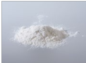
Particle size analysis in the range of 1-200 µm