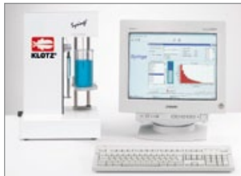
Evaluation software for Syringe®