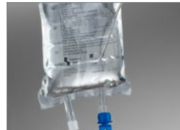
Sampling from bag